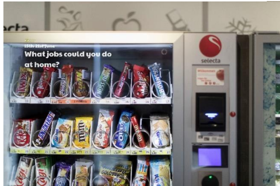
SMSC Picture news