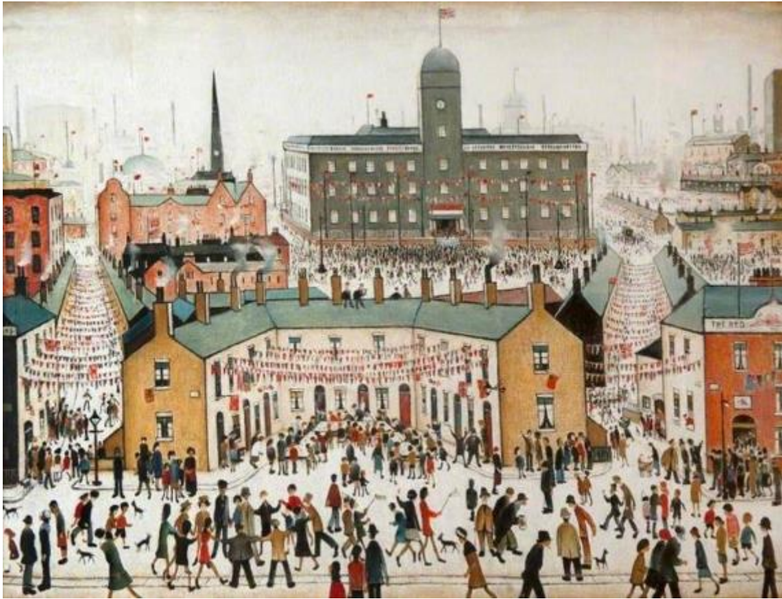
Bunting Design Ideas