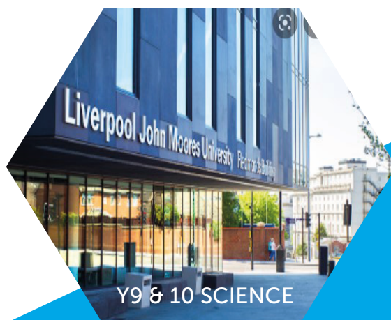
Y9 & 10 SCIENCE