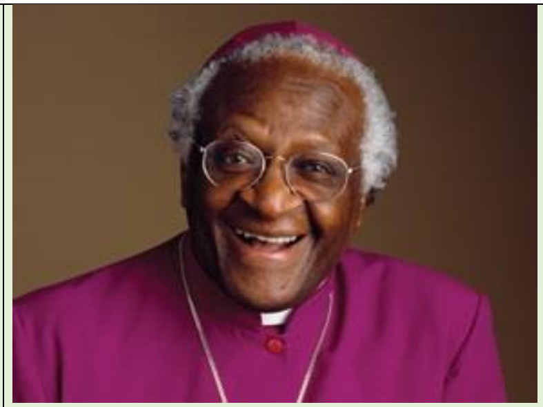
Archbishop Desmond Tutu, who tried to bring together black and white people in South Africa following the end of apartheid. When Nelson Mandela became president of South Africa, Archbishop Tutu chaired the Truth and Reconciliation Committee, where the perpetrators of terrible crimes met with and were forgiven by their victim

The Eucharist , also known as Holy Communion , is a sacrament that commemorates the Last Supper . Not all Christians celebrate this sacrament.