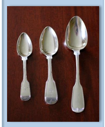
Tsp Dsp Tbsp

We use spoons a lot when preparing and making food.