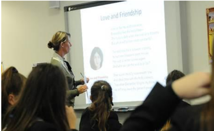
Our Creative Writing learners discussing 'Love and Friendship', the poem by Emily Brontë.