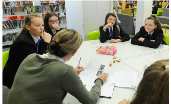
Celebrating National Poetry Day and creating 'list poems' using the theme of change.